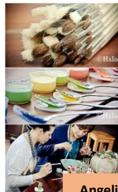
Angelic Wings Ceramics

Depart at 08:30 from the Boardwalk Hotel