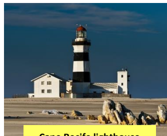
Cape Recife lighthouse

Depart at 08:30 from the Boardwalk Hotel