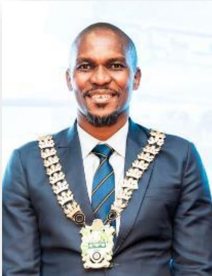
Sibusiso Mjwara IMESA PRESIDENT

06-08 NOVEMBER 2024 | GRAND WEST | CAPE TOWN